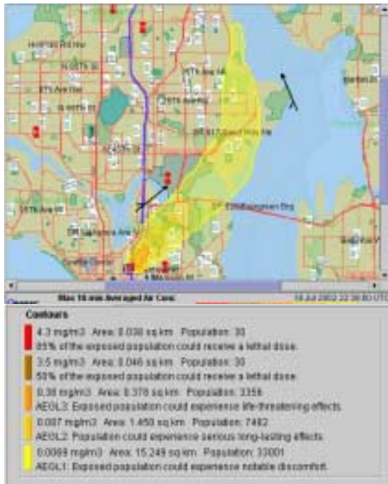
Figure 3. Example of customer value-added products, including plume, geographic data, health risk level, and affected population.

peak concentrations, and deposition. These quantities must be converted into products useful to emergency responders (Figure 3), including maps of plume hazard areas, affected populations, health effect risk levels, protective action guidelines, and geographic data (maps, terrain, aerial photography). Other potential value-added information include wind observations (barbs) and/or model wind field plots.